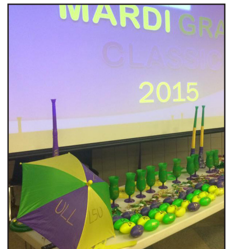
Trophies that were presented at the 2015 Mardi Gras Classic